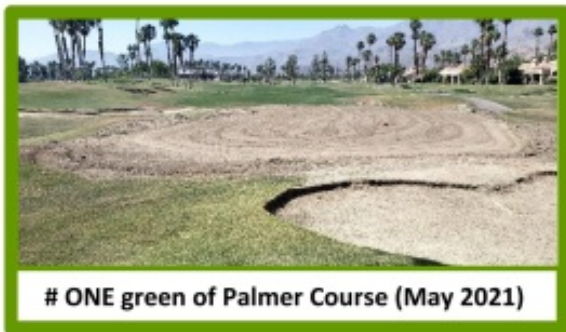
# ONE green of Palmer Course (May 2021)

The Stadium Course is also in line to be refurbished, but that is planned for 2022.