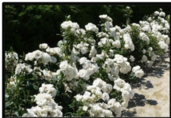
WHITE ICEBERG ROSES

Everyone loves roses. Our landscapers have planted many "iceberg" roses. They are the lovely white rose bushes you see in planters along the streets and against walls. These are trimmed and cared for by the gardeners.