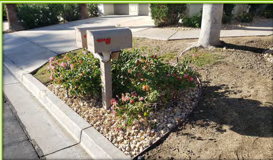
Mailbox areas will look like this once plants have a chance to grow