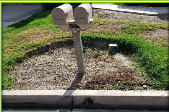
Mailbox area where flowers would have been planted

The street side areas are being rejuvenated by planting perennials in the mailbox areas. These will be more permanent replacements for the annual flowers in the mailbox areas. Each new perennial will have its own water source (head-to-plant). Landscape fabric is being placed around each plant and the areas will be filled with decorative rock. The plants were chosen for their heat tolerance and size when fully grown. By doing this, not only will the quantity of annual flowers purchased be reduced each year, the streets will have a more vibrant look during the hot summer months.