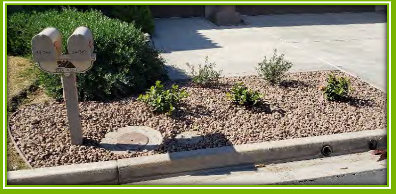
Mailbox area with new plants and decorative rock